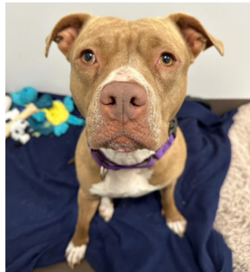
Queenie (840083) has been available for adoption at San Diego Humane Society since Oct. 14, 2022.

Project Dog Foster was created pro bono by marketing and media management companies CSBimpact and Simpler&Simpler . Their approach is lighthearted and fun, to capture awareness, consideration, and a smile. It includes a multimedia effort, including TV, radio and out of home digital ads. Participating organizations include City of Chula Vista Animal Services, Frosted Faces Foundation, PAWS of Coronado, Rancho Coastal Humane Society, San Diego County Department of Animal Services and San Diego Humane Society.