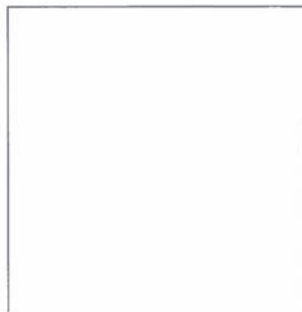
Draw your pet or include a photo above.